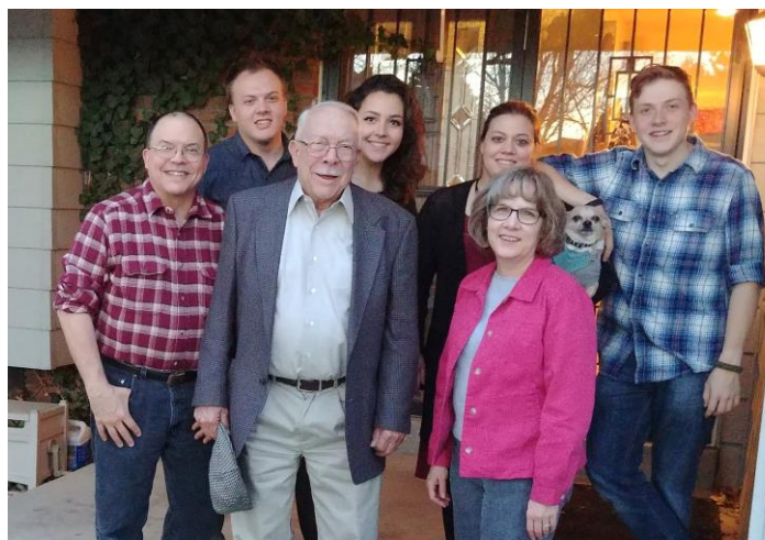
2017 Thanksgiving Dinner with Granddaddy