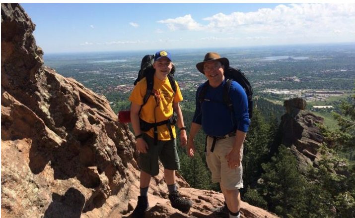
• Hike to Royal Arch in the Flatirons above Boulder in June.