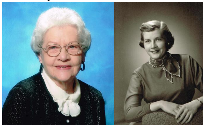
Born August 6, 1930, Bucklin, Kansas Died September 26, 2017, Westminster, Colorado