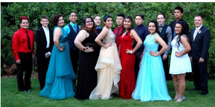
• Guests at this year's Home School Prom in our backyard.